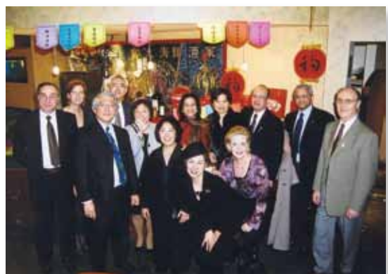
2003 celebrating Chinese New Year