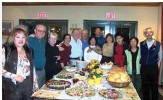
2002 Bingo Night