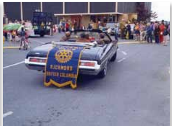
Parade Day - this float entered 8 parades in the early 70's and won 4 awards.