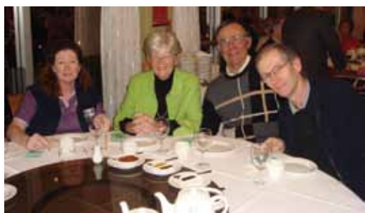
2007 celebrating Chinese New Year