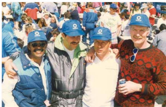
Whistler Ski Fellowship