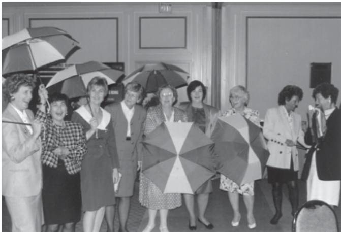
1970 Ladies Night Fundraiser at the Richmond Inn - the men acted as waiters!