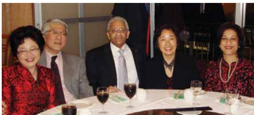
2007 celebrating Chinese New Year