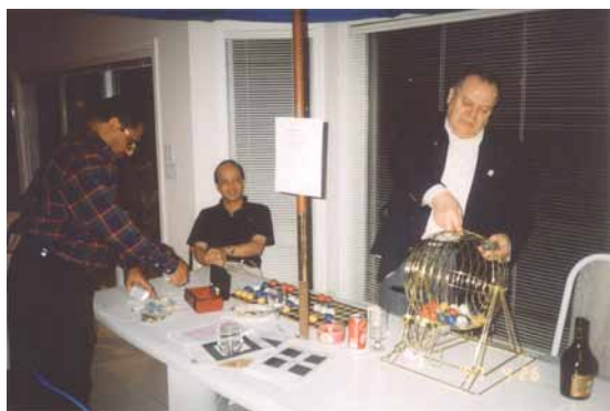
1997 Bingo Night