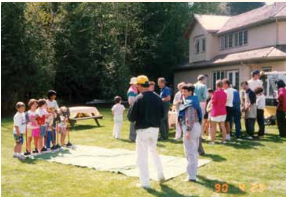
1990 Family Fun Day