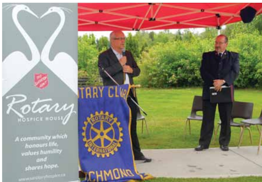
Richmond Mayor Malcolm Brodie

The Rotary Club of Richmond and The Salvation Army in partnership.