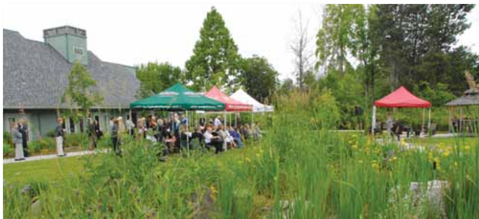
Vantage point from the pond