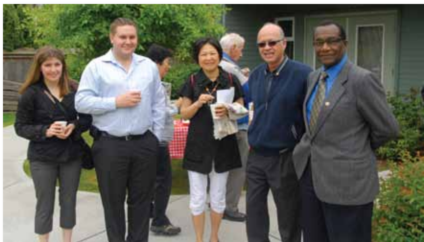
Rotarians and spouses attending the event