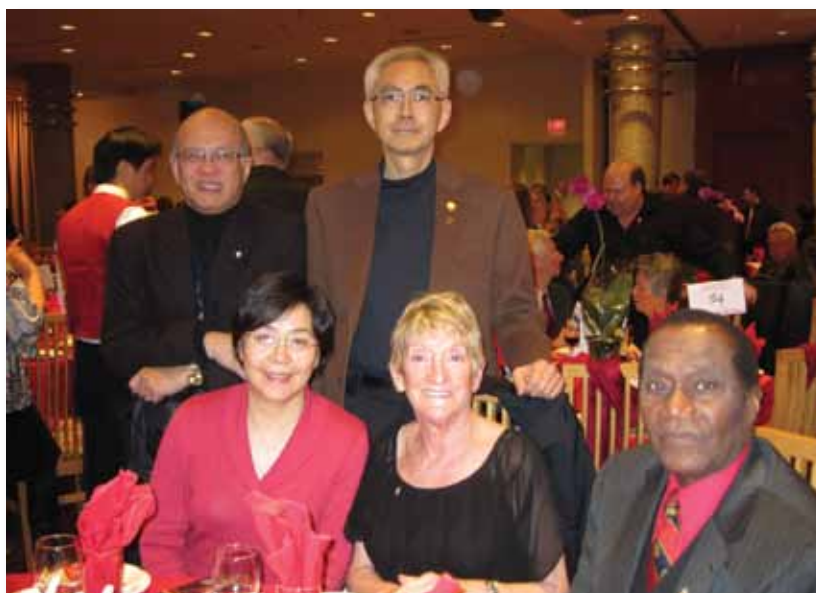
2012 celebrating Chinese New Year