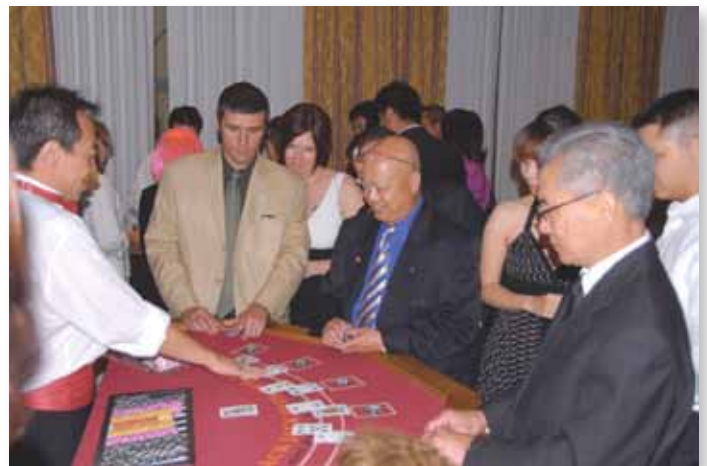
Rotary Club of Richmond Sunset and our club members enjoying joint Chinese New Year celebration 2007 and President's Ball 2009.