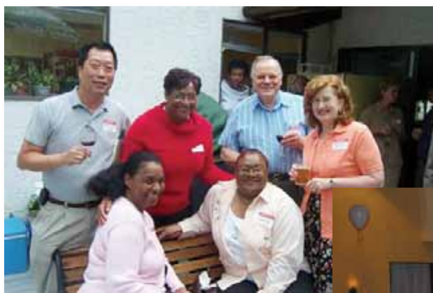
2004 Visiting Rotarians from Jamaica